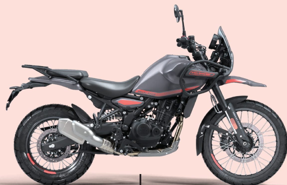
SLATE HIMALAYAN SALT