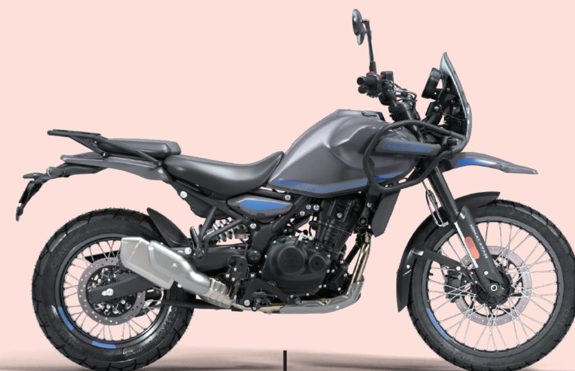
SLATE POPPY BLUE