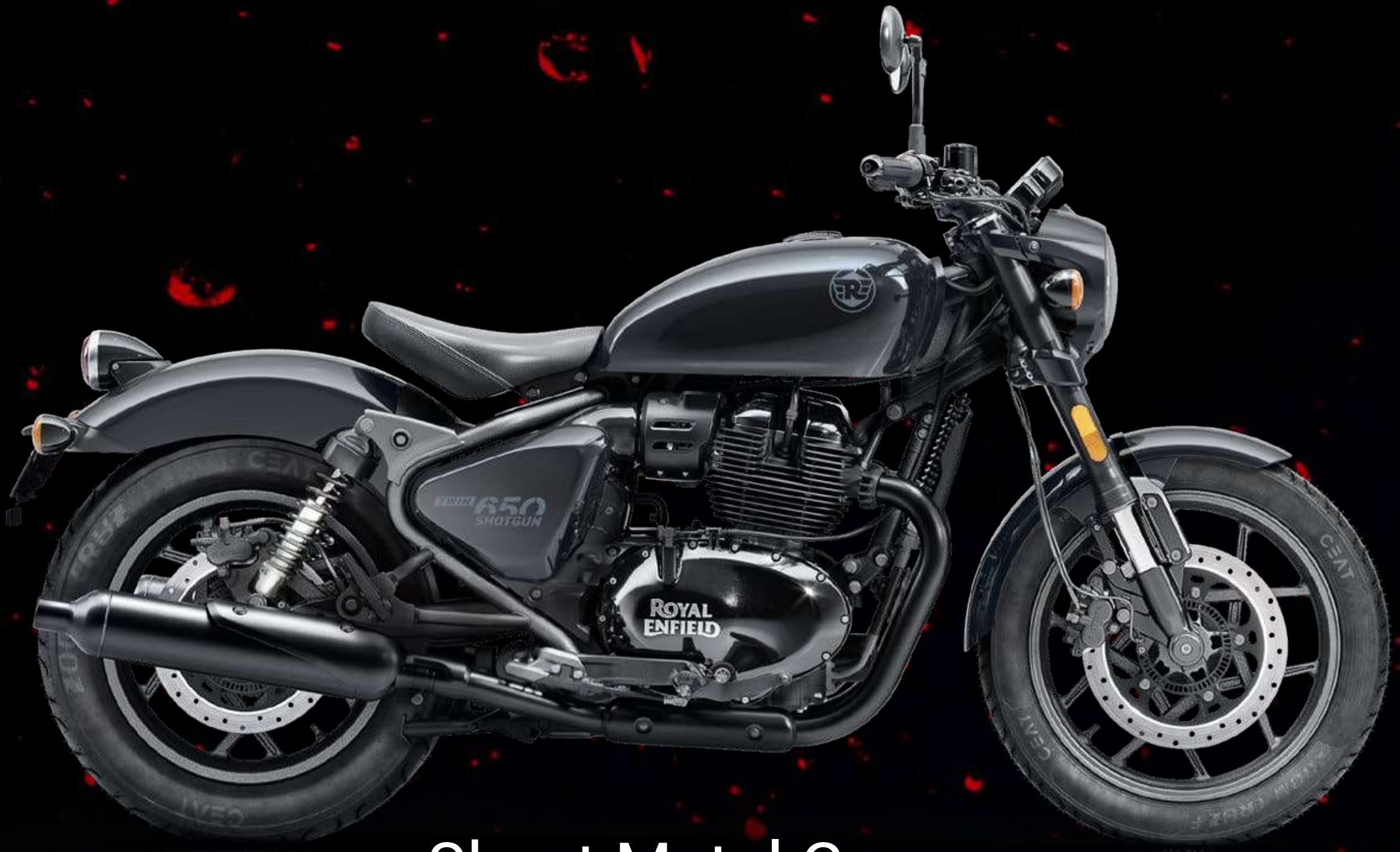
Sheet Metal Grey